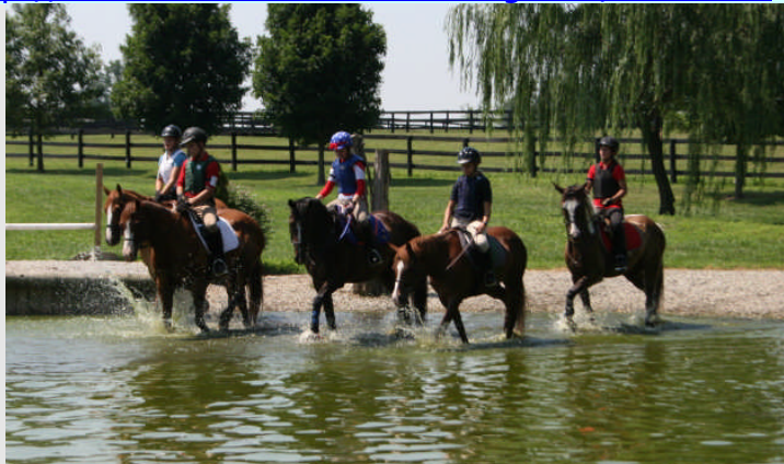
Midsouth XC clinic at Flying Cross - 2008